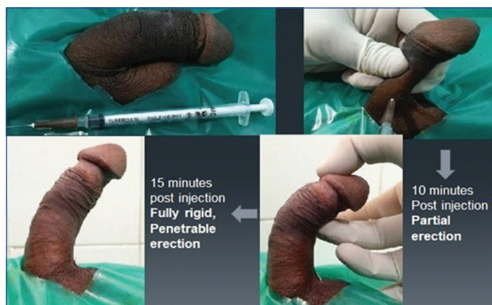
[Table/Fig-1]: Technique of Intracavernosal Injection of Vasoactive Drug (ICIVAD).