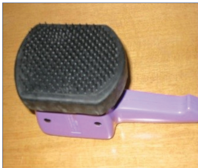
[Table/Fig-2]: Low cost vibrator used for PVS.